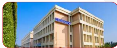
FATHER MULLER COLLEGE OF ALLIED HEALTH SCIENCES, MANGALORE