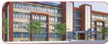
FATHER MULLER COLLEGE OF PHARMACEUTICAL SCIENCES, DERLAKATTE