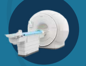
1.5T Helium free MRI