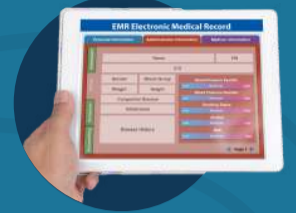
EMR paper free hospital