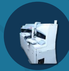
Fully Automated Track System