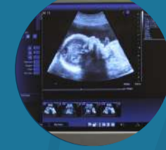
Fetal Medicine Volision