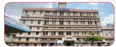
FATHER MULLER COLLEGE (SPEECH & HEARING) MANGALORE