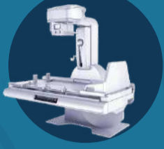
1000MA DR with fluroscopy