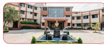
FATHER MULLER HOMOEOPATHIC MEDICAL COLLEGE, DERLAKATTE