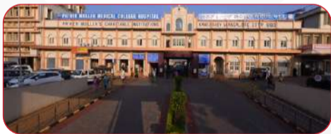
FATHER MULLER MEDICAL COLLEGE HOSPITAL, MANGALORE 0824 - 223 8163 / 8332 / 8333