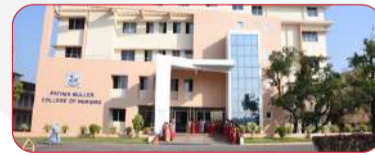
FATHER MULLER COLLEGE OF NURSING & SCHOOL OF NURSING, MANGALORE