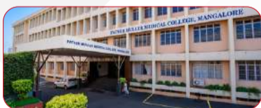
FATHER MULLER MEDICAL COLLEGE, MANGALORE