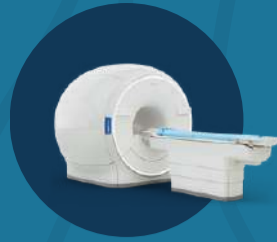
MR Ingenia Elition 3 Tesla