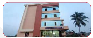
FATHER MULLER NURSING COLLEGE, THUMBAY, BANTWAL