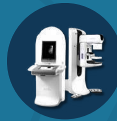
Mammography Tech with 3D Tomosynthesis