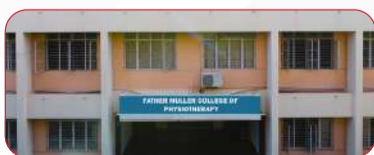
FATHER MULLER COLLEGE OF PHYSIOTHERAPY, MANGALORE